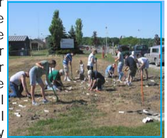
Volunteers establish a native plant buffer along the bank of Jordan Creek in St. Clair.

There are many sources of pollution affecting the 1,800 miles of waterways across our county, from failing septic systems to soil erosion to excess phosphorus from over-fertilization. At the St. Clair County Storm Water Program we are encouraging everyone to join us and do their part to protect our water. We provide workshops, educational materials and technical assistance on many topics related to water quality protection and restoration.