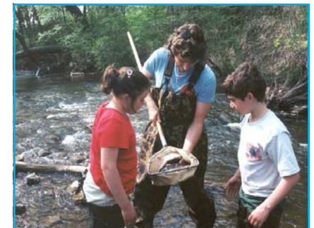
Stream Leader volunteers monitor the health of their adopted stream.

The best way for you to protect your local stream or river is through our Stream Leader Volunteer Monitoring Program . This program provides free training and equipment for volunteers and it only requires one day of field work in the spring and fall. It's a great family, scout or group activity and it goes a long way towards helping us understand and protect our waterways.